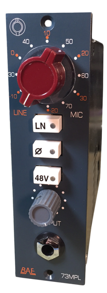
BAE 1073 MPL

BAE 1073 MPL, Sonic Farm Silkworm, Meris 440