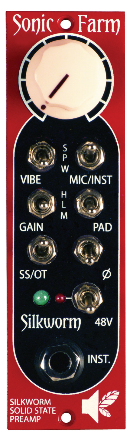
Sonic Farm Silkworm

If you're a sonic "fiddler," meaning you try anything to get it right before Record, then this is your preamp. The features are no BS. Each one is solidly designed and thought out. How they got all this into a 500 Series unit, that sounds good as well, is unbelievable. What you can believe is that you'll love this unit on many varied types of inputs for years to come.